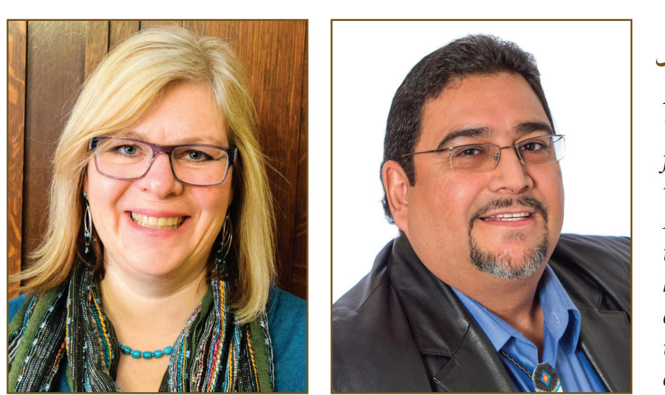
This presentation will provide an opportunity for people of Faith to find their place in understanding both the Truth and Reconciliation Commission and the United Nations Declaration on the Rights of Indigenous Peoples and the