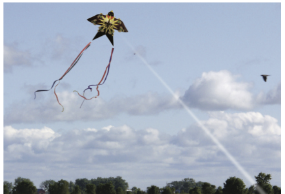
Airborne swallow kite, synthetic paper over a wooden dowel frame about 40 x 36 inches, 1990s

The first time I had this experience came when I flew a kite. I was standing out in a field looking at this kite, and suddenly the whole sky and clouds and scenery became so overwhelmingly beautiful. I could hardly stand it; it was such a beautiful ecstatic experience.