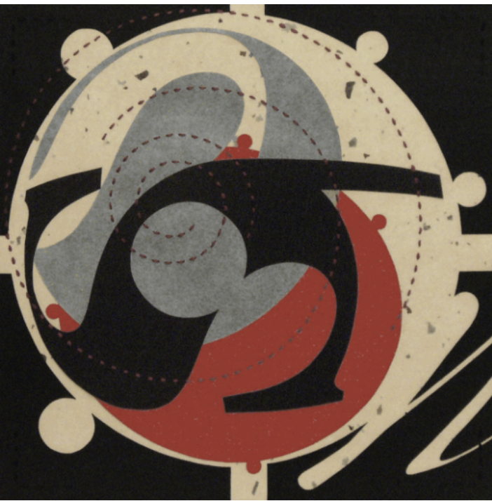
Typoem: 5 red wounds Norman's note: this image came to me during a most violent vertigo attack imaginable, when i saw swirling in my trance-like state the five wounds of christ, spinning cut paper + stitching (paper quilt), 14 x 14 inches, made in about 2009

return to 60s thinking, risking being misunderstood.