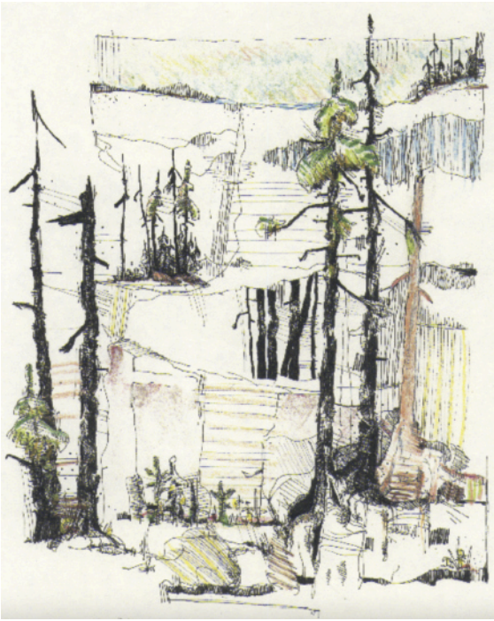
Drawing: state of life and death

Norman's note: it is striking to see how the cycle of life is everywhere in evidence in the boreal forest, with seedlings sprouting amongst the mature trees, and aging barely alive trees, and the dead giants