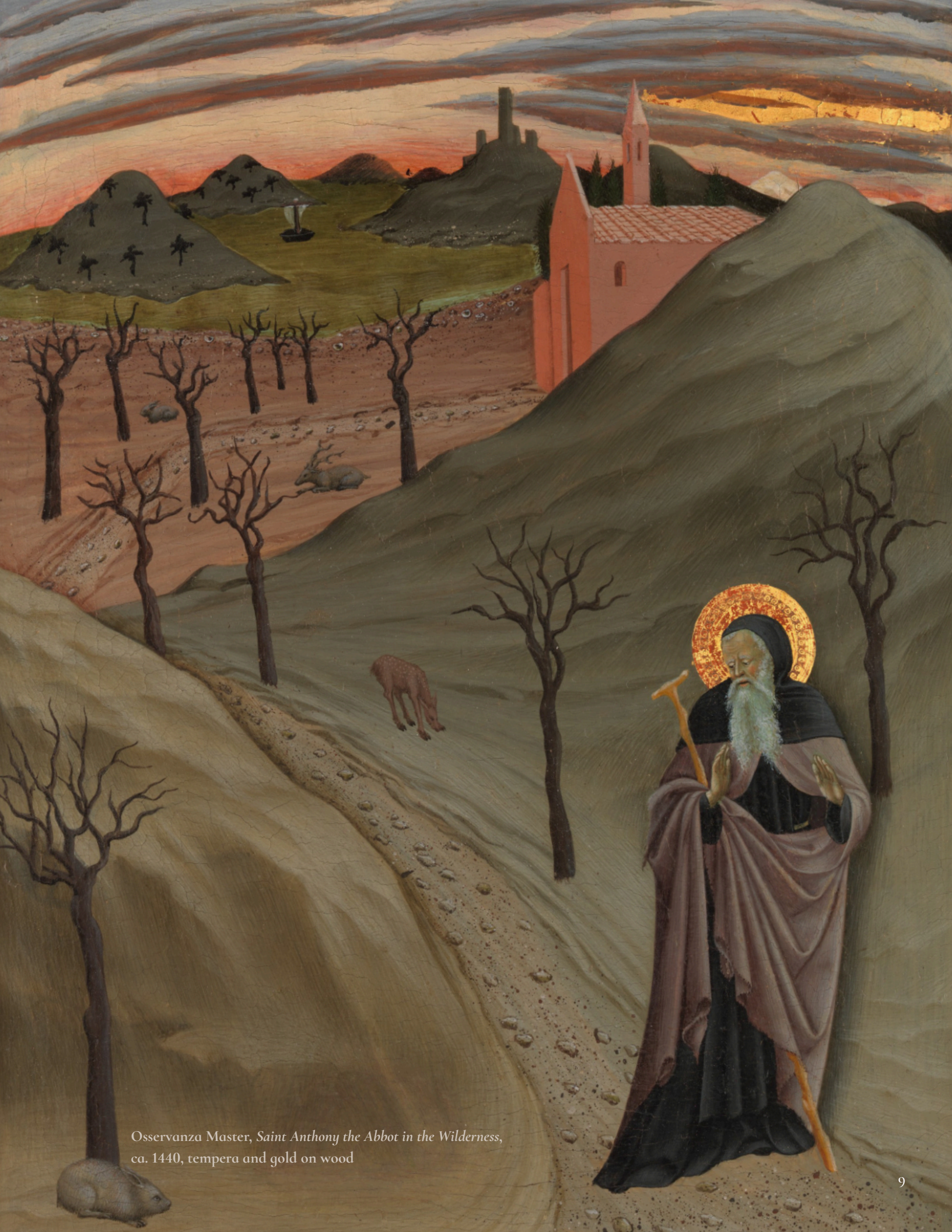
Osservanza Master, Saint Anthony the Abbot in the Wilderness , ca. 1440, tempera and gold on wood