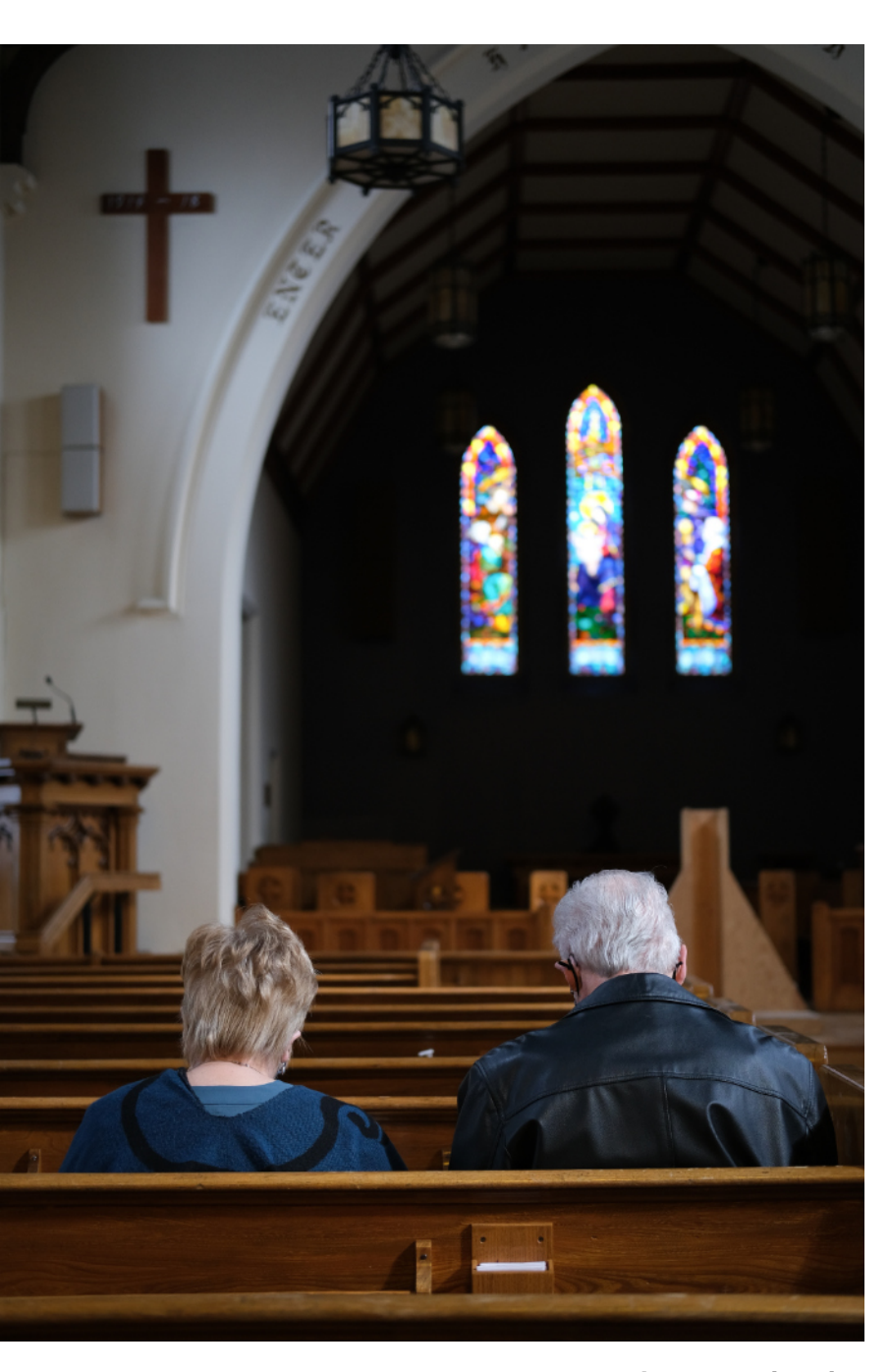
Couple on Good Friday A couple attends Saint Margaret's Anglican Church for Good Friday. Date Taken: April 2nd, 2021 Camera: Fujifilm X-T4, 35mm f/2 Film Stock: Superia X-TRA 400