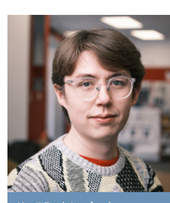
Kenji Dyck is a freelance videographer, photographer and filmmaker based in Winnipeg, Manitoba.